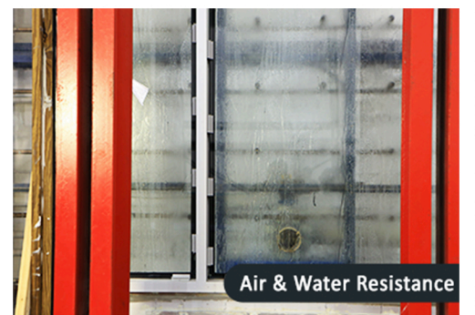
Air & Water Resistance

For more information pertaining to QAI's testing, inspection and certification services, please contact us via: info@qai.org