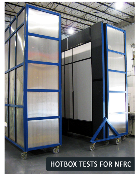
HOTBOX TESTS FOR NFRC