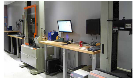
Tensile Testing Lab

With over 30 years of experience, QAI is an ISO/IEC 17025 accredited independent third-party testing laboratory. Our state-of-the-art equipment and expert team serve companies of all sizes with material testing. As part of the QAI Laboratories Group, a globally recognized leader in testing, inspection, and certification, we provide services across various industries, including manufacturing, building products, electrical safety, EMC/EMI, and vehicle compliance, with locations in North America and Asia.